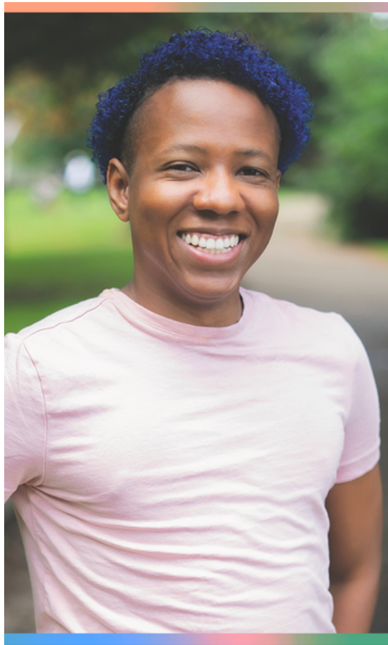
Photo of Author Kacen Callender